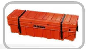
All in one EzeeBOX