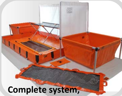
Complete system, 1 EzeeBOX